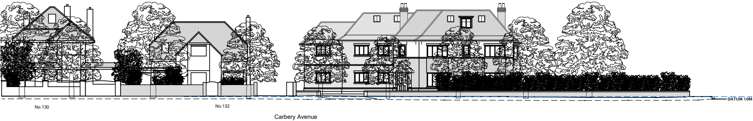
Proposed Street Scene to Carbery Avenue